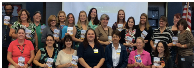
WALMART made twenty teachers very happy to receive gift cards in a surprise drawing held this month.

First Congregation Church ❖ Our Savior Lutheran Church ❖ First United Methodist Church ❖ Elks Lodge Moose Lodges ❖ Angel Ladies of the Masonic Lodge #198 of Zephyrhills ❖ Betmar ❖ Sundance ❖ Casa del Sol Mobile Home Parks ❖ 1 st National Bank of Pasco County ❖ Kiwanis Greater Pasco ❖ Women's Club of Zephyrhills ❖ Direct Auto Insurance ❖ Chalet Florist Norm & Sons Tire & Auto ❖ Pining #4 U ❖ Florida Hospital Zephyrhills ❖ Five Guys ❖ Jersey Mike's ❖ Suncoast Credit Union ❖ Zephyrhills Chamber of Commerce ❖ Historehouse ❖ WALMART.